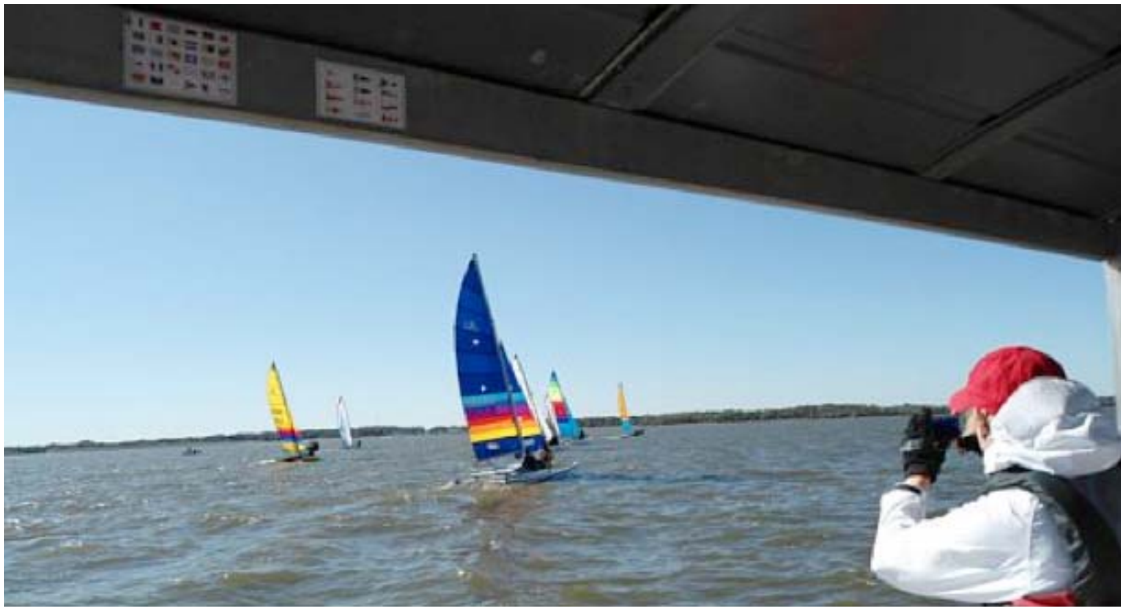
Muddy Waters 2011

And thanks to the cat fleets for making this into a very fun and successful sailing season.