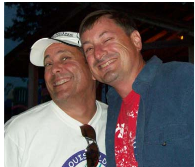
"musical entertainment" and birthday boys above, good friends enjoying a mild fall evening meal at CSA at left.