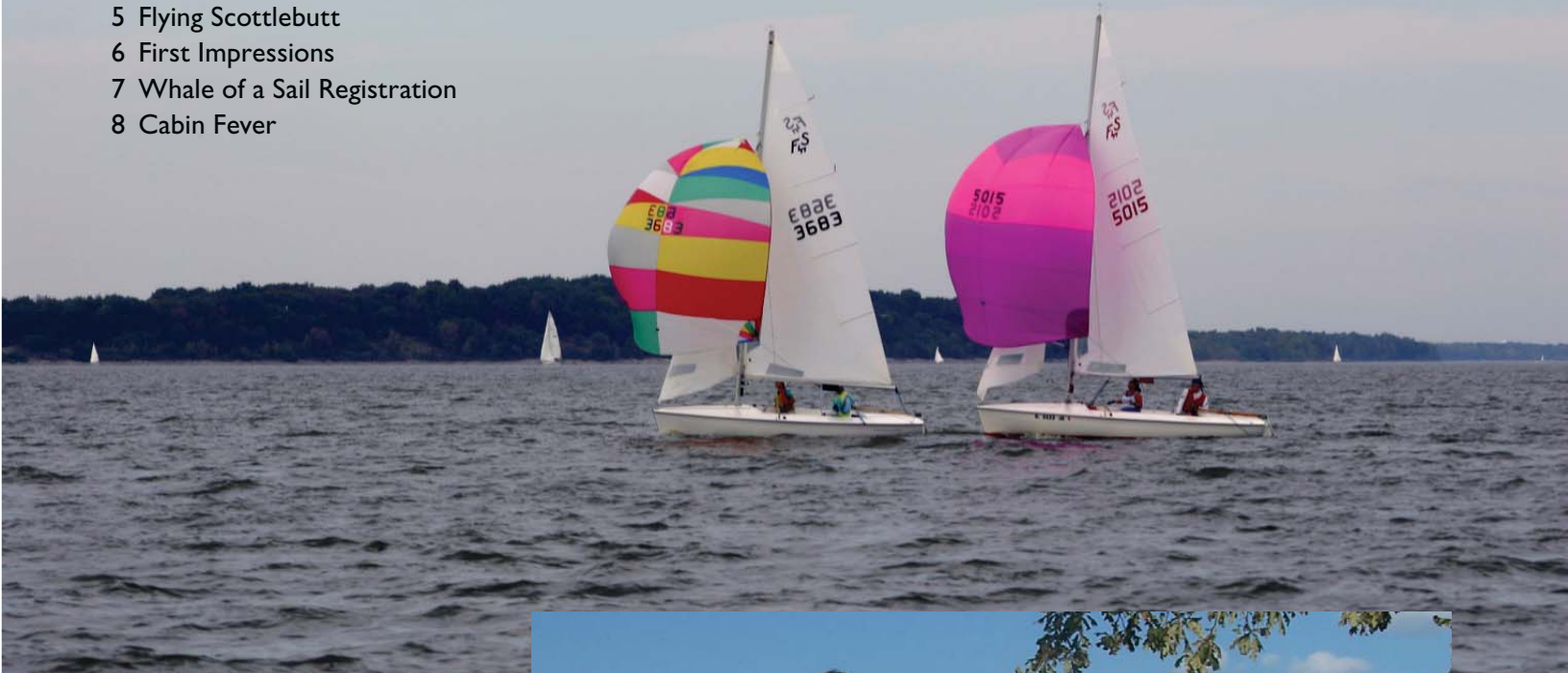
2009 Whale of a Sail