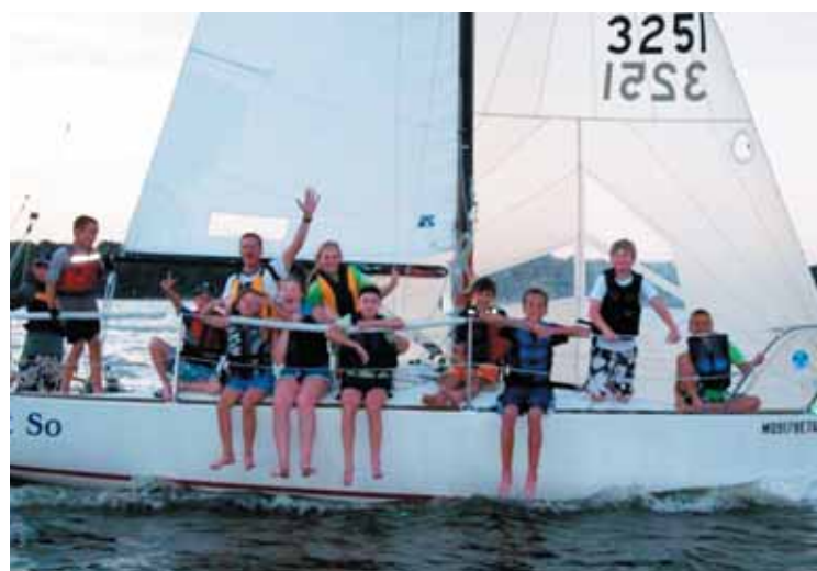
Evening sail with Junior Campers