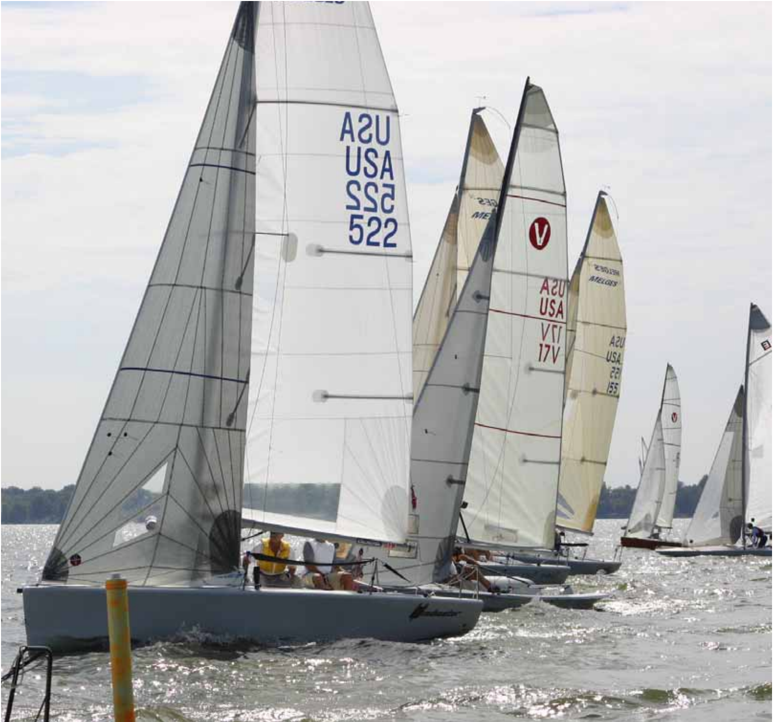
No particular reason... just a picture by Cal Guthrie from the Whale of 2009. (editor's note)