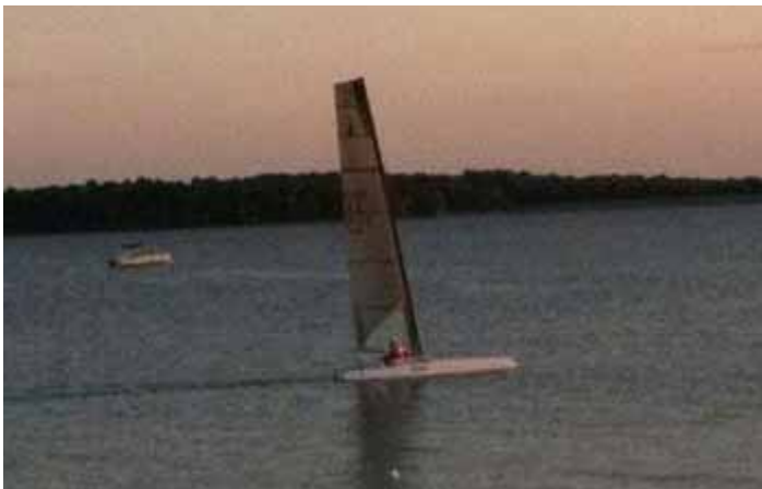
Rick Bernstein sailing an A-Cat (Joe's A-Cat!)

Anemometer – Device used to measure wind speed, often on the Beaufort, scale, which classifies sea conditions for sailors, The Categories (or "forces") are: 1. No wind at all; 2. Too little wind; 3. Too much wind; 4. Much too much wind; 5. Wind, wind, wind---- whoooooee, will it ever stop blowing?; and 6. Blammo!