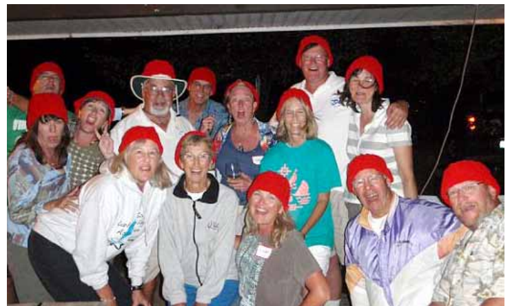
The Red Strawberry Hat crowd