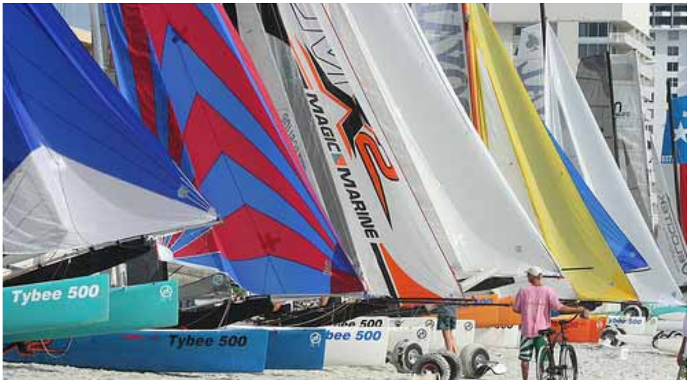
Basic boat – Term used to describe what is actually included in the advertised price of a boat-typically several hundred gallons of resins and glue, a hundred or so sheets of marine plywood, a ton of lead, a sewing kit, and an instruction book. By contrast, a boat is “sail-away condition” boasts a host of convenient extras, such as a deck, a cabin, an engine, an anchor, a tiller or wheel, a rudder, and sails, spars, rigging, fittings, and winches.

I know a few of you watched the Tybee 500 race up the coast of Florida to Tybee Island this year. They had a really good showing with 24 entries. There were also some interesting results as far as boat choices. The Nacra I-20 has been the boat of choice for long distance racing for years and this year there were not only several F-18s but they hold the top 4 slots in the results. There were several Hobie Tigers in the F-18 fleet as well. Perhaps the Tigers have found their niche though I still wouldn't want to sail one in the Tybee! Two more feet of stability can be a big deal. One big issue they have had an ongoing problem with accidentally breaching security around the Cape Canaveral shuttle launch pads. This year they upped the time penalty to 40 minutes in an effort to keep the boats 3 miles off-shore around the secured area of the Cape but there were still 2 boats that strayed too close, one being the winning team. This year they placed trackers on the boats so you could watch their real-time progress on-line. It was really cool to see! I really hope this is an upswing for this race as participation had been decreasing over the last few years. Look for it again in May 2010!