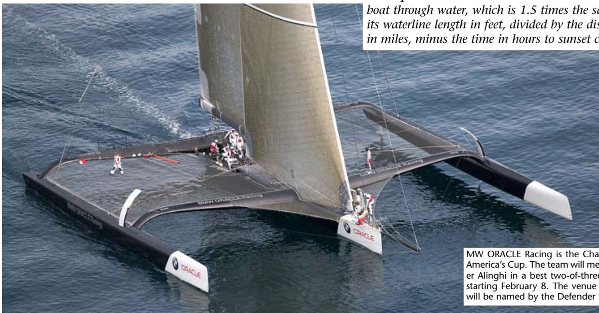
MW ORACLE Racing is the Challenger for the 33 rd America's Cup. The team will meet the Swiss Defender Alinghi in a best two-of-three head-to-head duel starting February 8. The venue for the competition will be named by the Defender by August 8.

Hull speed – The maximum theoretical velocity of a given boat through water, which is 1.5 times the square root of its waterline length in feet, divided by the distance to port in miles, minus the time in hours to sunset cubed.