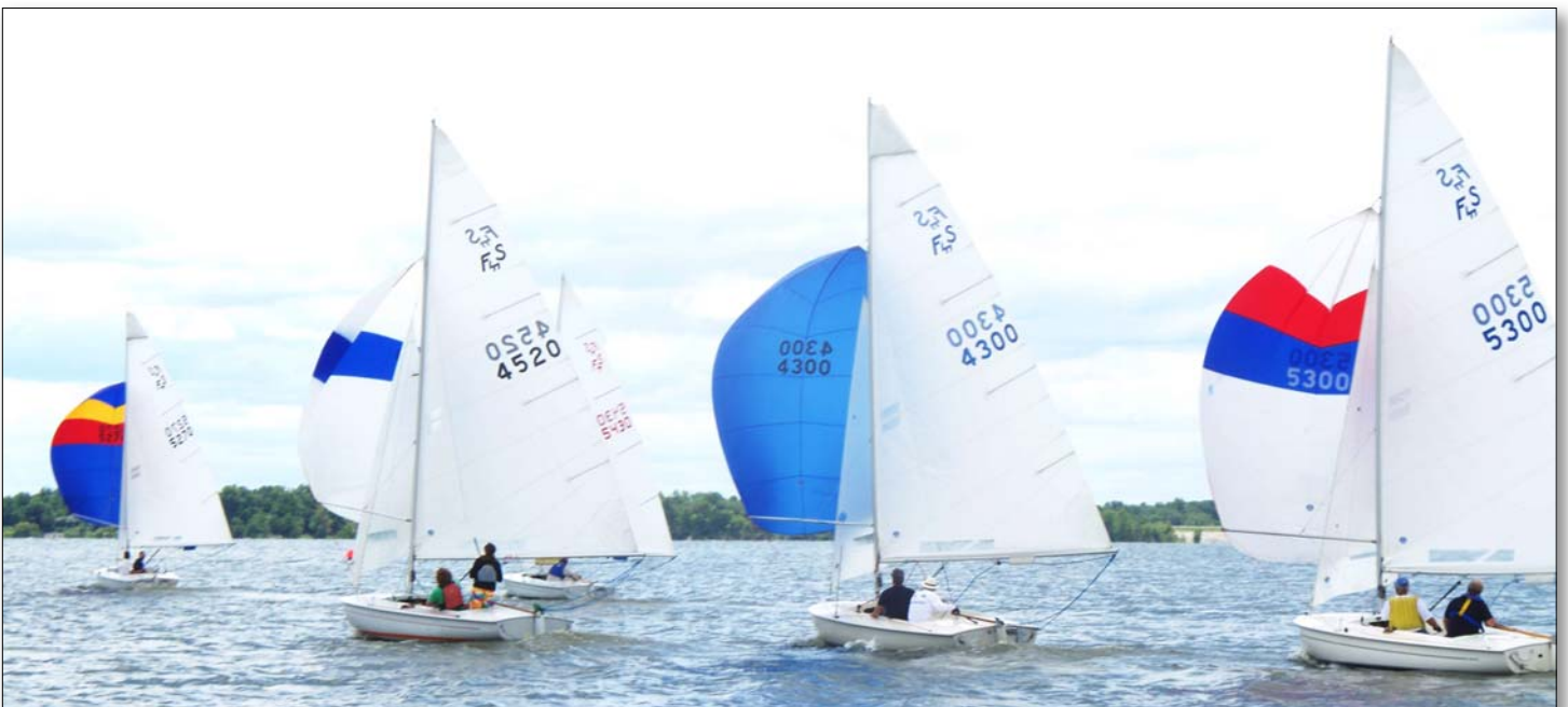
CSA Champions flying chutes!