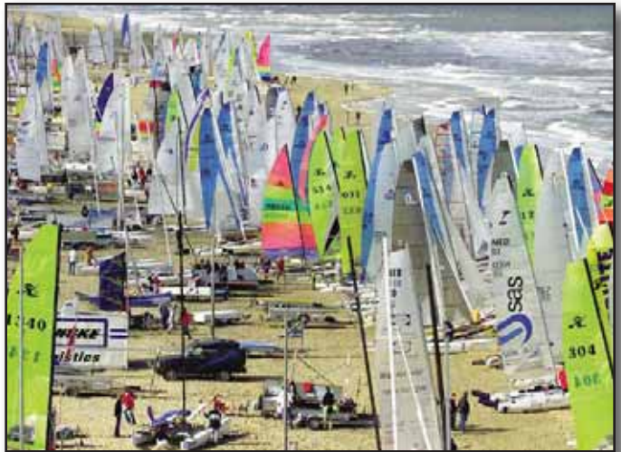
Future low PHRF fleet

Can't wait to see you all at the lake this weekend!