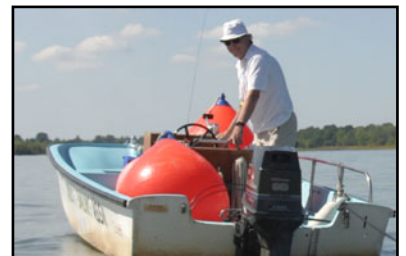
All photos from the 2005 Whale of a Sail CD