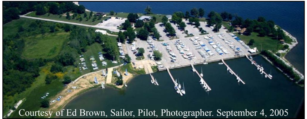
September 4, 2005

Carlyle Sailing Association, Philippi Harbor, Carlyle, Illinois