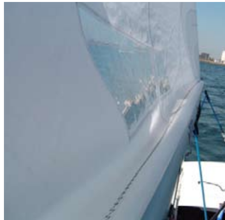
Proper jib luff tension will show slight "crow's feet" off snap. The luff wire should only begin to tension in very heavy winds.

luff. These will appear as "crow's feet" off each snap. Never leave the halyard tension loose enough so that there is "sag" between each snap, but only crank the halyard so tight that the crow's feet are removed in heavy winds when overpowered. There is no need to adjust the lashing at the head of your jib if you use the above suggestions.