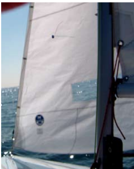
When steering in the upper ranges of the "groove" don't be afraid to allow the windward telltale, and at times even the luff of the jib, break.

However, in breeze, when the boat is overpowered, it will be unusual, unless sailing through very large waves, that the weather telltale will not show a stall. In fact, in very breezy conditions, the luff of the jib will actually be breaking as far back as 12 inches. With the tight rig jib the groove is quite wide and when trying to accelerate, both telltales will nearly be straight aft, and when sailing in point mode and when trying to depower, again, the luff of the jib will be actually breaking.