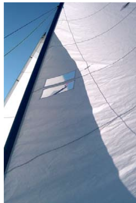
Proper luff tension will show wrinkles along the luff.

As previously mentioned, upwind in heavy air, the vang is set hard enough to restrict the upward movement of the boom to just allow the upper batten to ease no more than 5° to 10° past parallel to the boom. In these conditions, as mentioned, the mainsheet simply acts as a traveler and allows the boom to move mostly sideways and outboard. With each wind velocity the vang tension applied depends primarily on crew weight. Lighter weight crews will tension the vang earlier due to becoming overpowered earlier, while heavier crews might not need boom vang tension until much heavier winds.