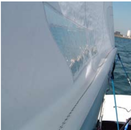
Judge outhaul tension by the relationship of the shelf seam to the side of the boom.

Your North mainsail is constructed with a shelf foot so it is possible to make the lower half of the main deeper when sailing downwind. Usually the outhaul is tight enough upwind so that there will be only a 1 1/2" to 2" (3.8 cm to 5.1 cm) gap between the side of the boom and the shelf-foot seam in the middle of the foot. In heavy winds, pull the outhaul tighter to close the shelf and flatten the main. In extremely heavy winds, above 18 mph, the outhaul should be tight enough so there is a hard crease from the tack to the clew. In lighter winds or choppy seas, ease the outhaul until the gap between the side of the boom and the shelf seam is 2". When going downwind, ease the outhaul (if there is time and opportunity) until the gap is a full 3-4".